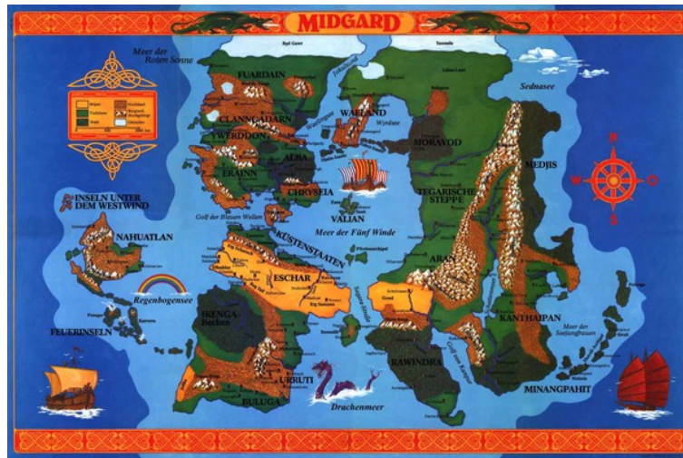
Figure 10: Map of "Midgard" 26 [44]