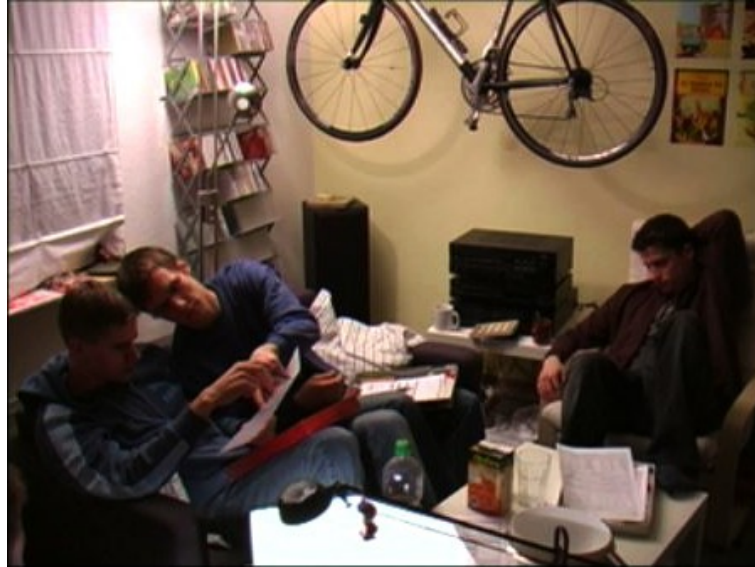
Figure 7: Group II-2 [36]