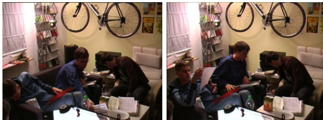
Figure 6: Group II-1 [35]