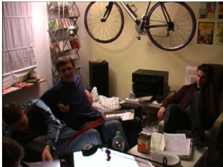
Figure 8: Group II-3 [37]