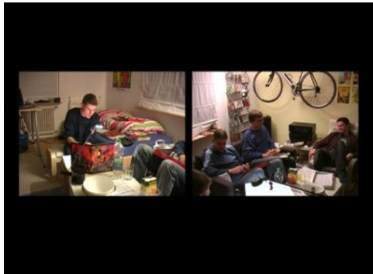
Video 2: Maps and planning actions