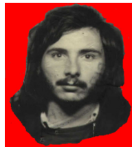
Illustration 3: Brian ROBERTS—Photo booth 2, 2003, from original 1971 (ROBERTS, 2011) (Footnote 8)