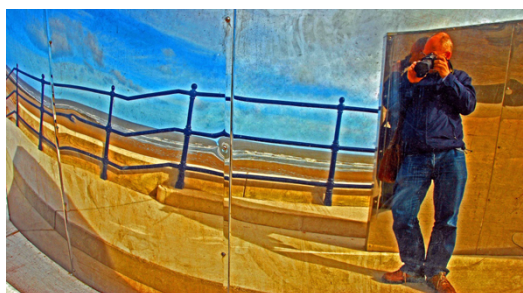
Illustration 1: The practice of photography—self-portrait, 2009 (B. ROBERTS, 2011) 1 [1]