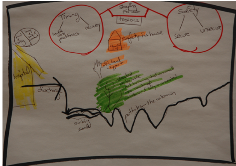
Illustration 1: The road to recovery

this involved constructing a visual map of the participant's story on an 8½ x 11 inch piece of paper (LAPUM et al., 2011). See Illustration 1 and 2 for examples of these narrative maps.