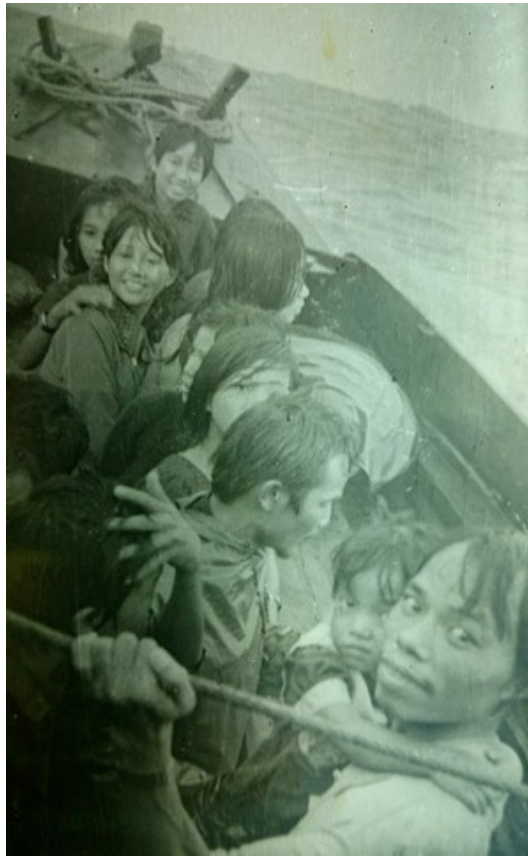
Illustration 3: Vietnamese refugees on a boat [30]

Step 1: Pre-iconic description: A group of men, women and children huddle together on a boat at sea. In the forefront, a middle-aged man wearing a watch has a young child in his arms, and looks at the photographer with a faint smile while holding on to some rope. The child clasps both arms around the man's neck. A young woman at the center of the photograph looks towards the photographer with a startled expression. In the background, two women smile. Others look out to sea; one person re-arranges his/her hair, as all passengers have damp hair. The open-top wooden boat is relatively small in size. The picture is not "straight" as indicated by the angular shape of the horizon. However, the sea looks relatively calm and the boat does not seem overcrowded. This photograph was cataloged by the RRC with the keywords "Vietnamese/boat people/flight by sea/refugees;" however, there is no information on the photographer, the location of the boat, the planned destination, or the year in which this photograph was taken. [31]