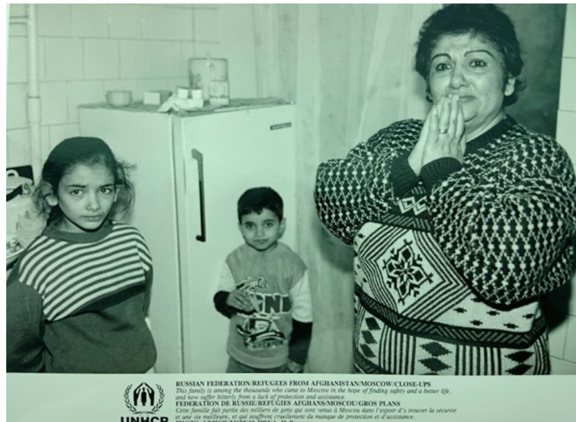
Illustration 1: Afghan refugees in Moscow [20]