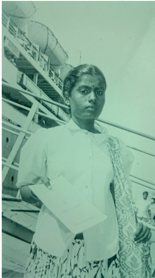
Illustration 4: Woman with identity card [35]

Step 1: Pre-iconic description: A young woman is pictured by herself as she shows her Identity Card (words typed in capital letters at the center of the document) to the photographer. She is not smiling, but has a composed expression. She holds on to her fabric shoulder bag. The woman has dark skin and her hair is tied back. She is wearing a patterned pleated skirt, a white blouse, a bracelet, earrings, and a teardrop-shaped "bindi" on her forehead. She stands in front of a movable passenger bridge with metal railings, which is connected to a large ship in the background. The name of the ship starts with "AK"; two to three people are standing on the deck, looking on. A man is seen in the background, walking towards her location and away from a vehicle. The Identity Card is relatively large, and looks like a booklet. The other words printed on the white cover are indiscernible. There is no indication of who the young woman is, her ethnic background, country of origin, her location, the year in which this was taken, or who the photographer was. There are no captions or keywords. [36]