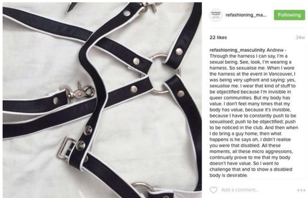
Figure 1: Sample Instagram post from "Refashioning Masculinity" fashion show [15]