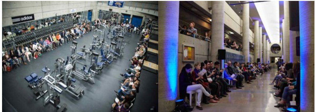
Figure 2: Runway configurations for "Refashioning Masculinity" fashion show [20]

in it. This contrast emphasized and exposed the arbitrary and symbolic construction of patriarchal gender binaries without harming participants.