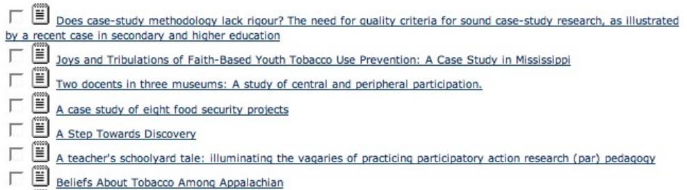
Figure 5: Selection choices