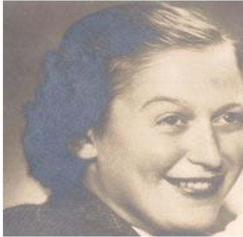
Figure 6: Anka, Czechoslovakia, 1945 (with kind permission)