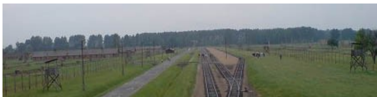
Figure 4: Birkenau and Polish forest [7]

recognition of imminent defeat. The chimneys and few remaining crematoria are accompanied by a small number of wooden stables that housed first horses, and then the Jews of Birkenau—a makeshift camp.