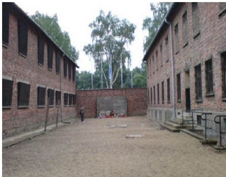
Figure 2: Barracks and execution wall in Auschwitz (researcher photograph 2007) [4]

As I consider this impossible fact, I remember Anka's defiant words: