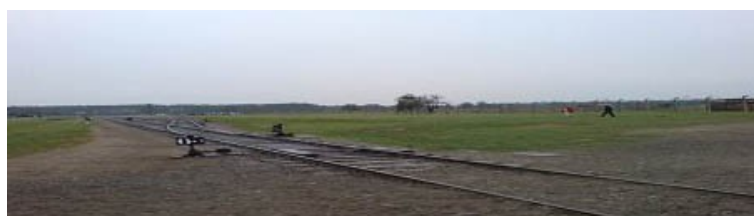
Figure 3: Train tracks, Birkenau (researcher photograph 2007) [6]

When I lift my head the space is silent. We move to Birkenau—groups of people, shifting places, passing one another then looking away.